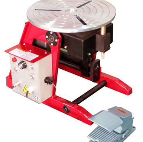
Table diameter 350mm.

Harbach Positioning Positioner Model LPE0.1-WD Series is designed to give maximum positioning flexibility by using the tilt and rotation of the table to manipulate the work piece into the correct 'down hand' position for welding or to position accurately for assembly and manufacturing requirements. The table is machined with four radial slots for anchor bolts and centric marking on the surface table, a set of tapered bearing mounted below the table to give a smooth and constant turning during operation. Driven by a DC motor with variable speed, controlled by a standard control pendant with low voltage push button and potentiometer with a 3-meter control cable built in. Tilt movement is electrically powered driven by 65W DC motor with dynamic braking through reducer gearbox. Built in with 300amps rotary clamp to ensure good earthing to the welding power source.